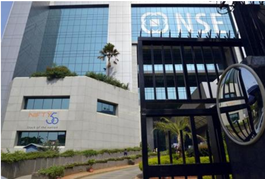
NSE IPO values it at Rs45,000 crore