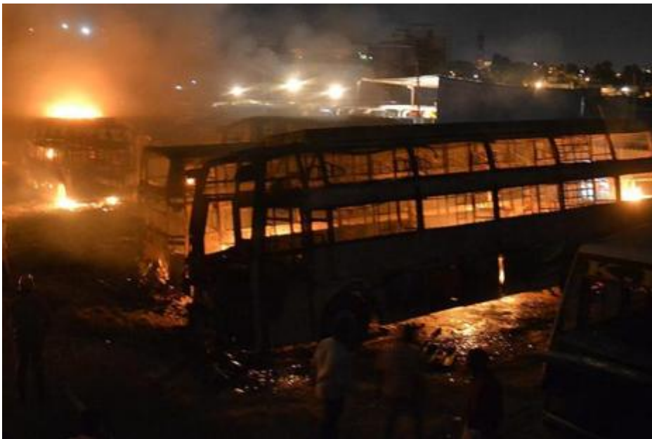
Why did Bengaluru burn?